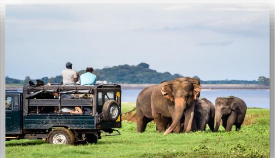
Minneriya National Park Safari -$75