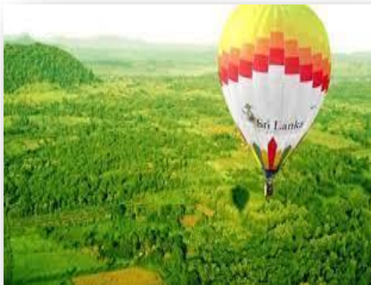
Hot Air Ballooning -$300