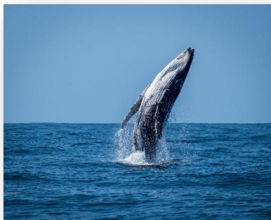
Whale Watching Tour -$110