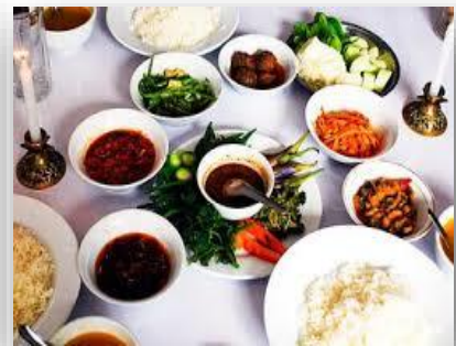
Cooking Demonstration -$35