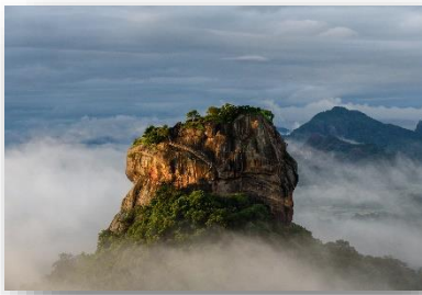
Sigiriya – $45 per person