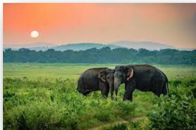
Yala National park safari - $145