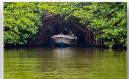
Madu River Boat Ride - $60