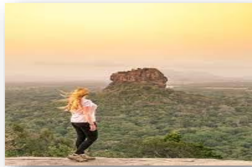
Pidurangala Rock at Sunrise - $20 per person