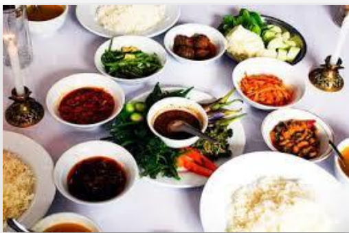
Cooking Demonstration - $35 per person