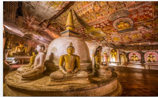
Dambulla Cave Temple -$17