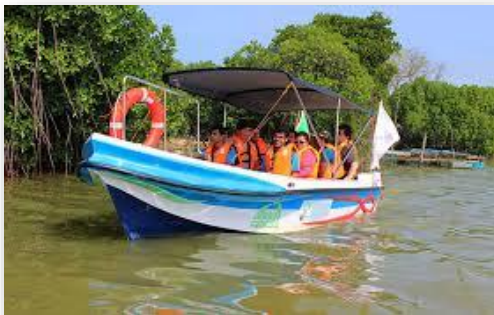
Negombo Lagoon Boat Ride - $50